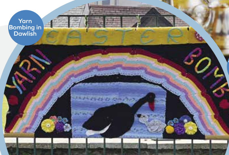
Yarn Bombing in Dawlish