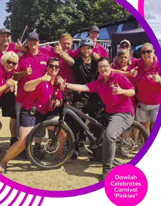
Dawlish Celebrates Carnival 'Pinkies'