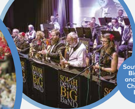
South Devon Big Band and the Big Christmas Bash.