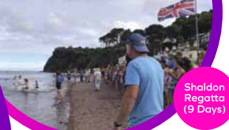
Shaldon Regatta (9 Days)