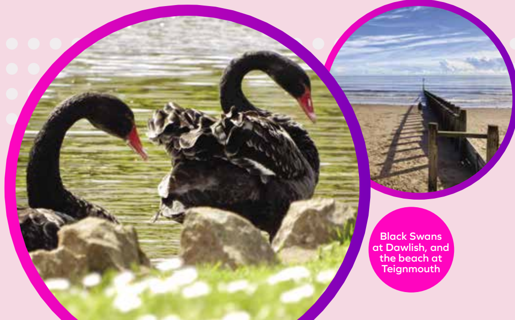
Black Swans at Dawlish, and the beach at Teignmouth