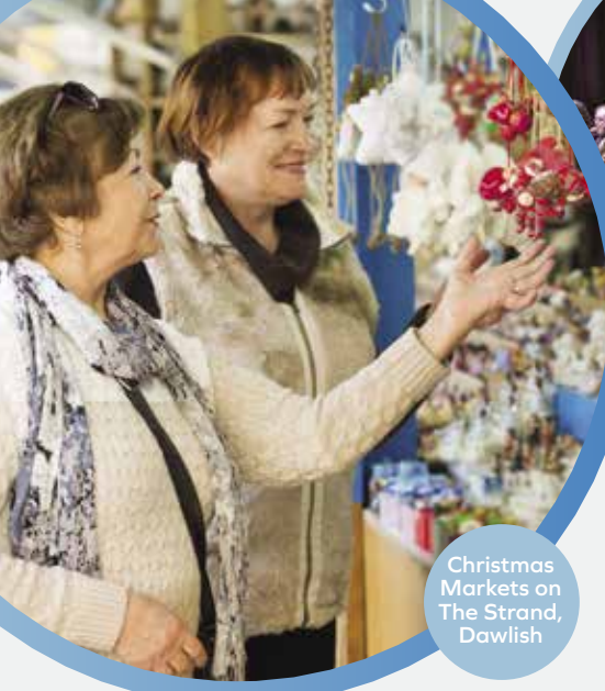
Christmas Markets on The Strand, Dawlish