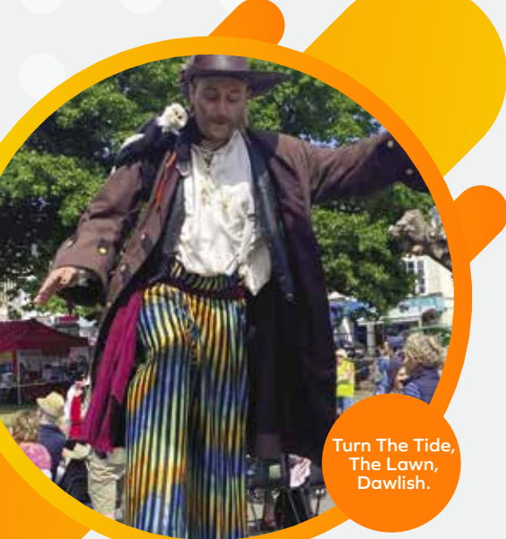
Turn The Tide, The Lawn, Dawlish.

Pavilions Teignmouth, Den Crescent, Teignmouth TQ14 8BG. Embrace the silliness, dive into a sea of words and an absurd alphabet soup of poppycock & gobbledygook. Meet celebrated Edward Lear characters; the Quangle Wangle, the Jumblies, and the legendary Owl & the Pussycat in the greatest literary love story since the Dish ran away with the Spoon. Told with fabulous puppets, an innovative stage set and a brilliant new musical soundtrack. Tel: 01626 249049 boxoffice@pavilionsteignmouth.org.uk www.pavilionsteignmouth.org.uk £8.50 per person