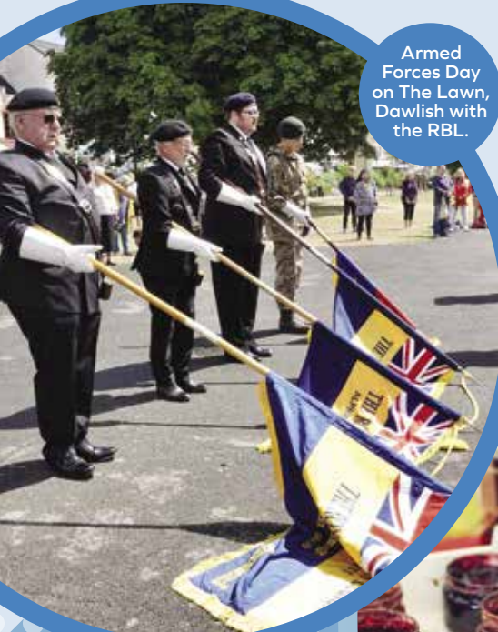
Armed Forces Day on The Lawn, Dawlish with the RBL.

Entry: £20 for adults, £17 concessions, £13 for under 16's