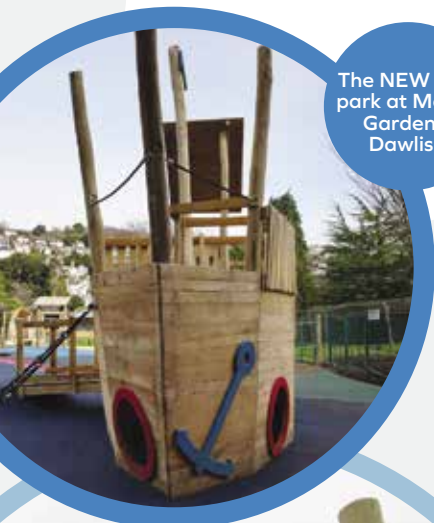
The NEW play park at Manor Gardens, Dawlish