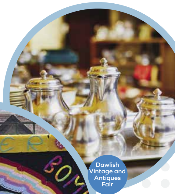
Dawlish Vintage and Antiques Fair