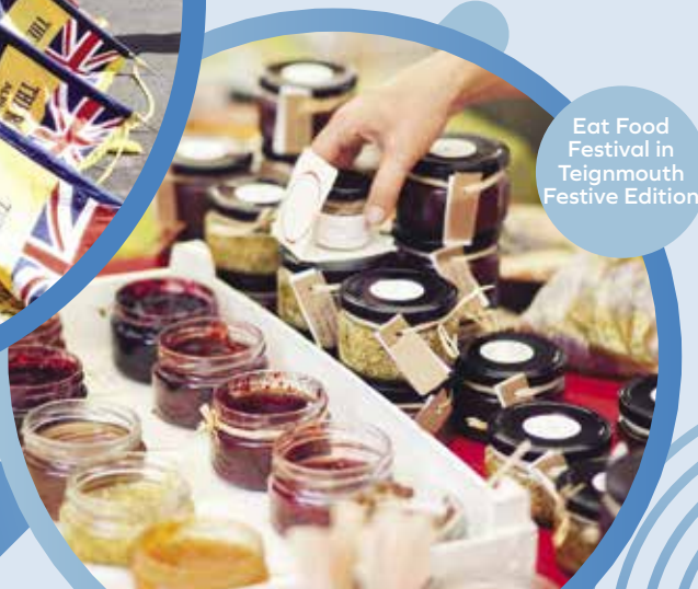
Eat Food Festival in Teignmouth Festive Edition