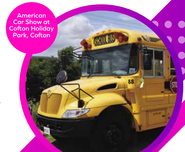
American Car Show at Cofton Holiday Park, Cofton